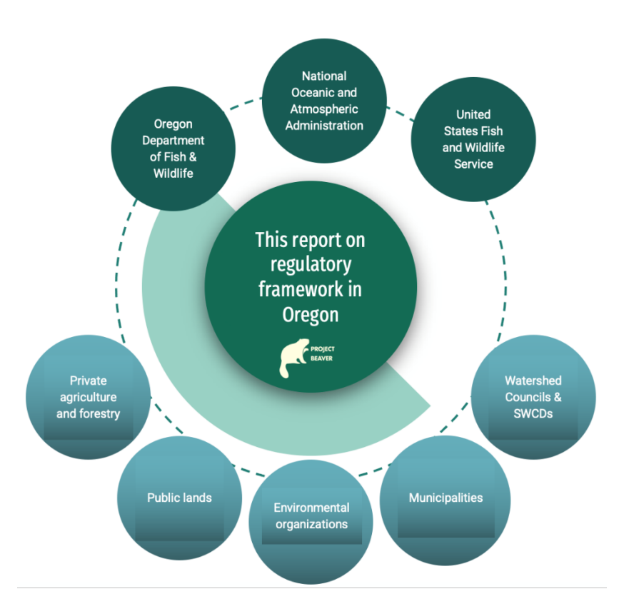
Figure 1. This report consolidates information from government agencies for those implementing beaver-based restoration.

State and federal plans for the conservation and recovery of salmon and steelhead species listed in the Endangered Species Act (ESA) describe how beaver and beaver dams can create high-quality rearing habitat for juvenile salmon and steelhead. For example, the federal recovery plan for Oregon Coast coho salmon specifically recommends beavers, beaver dams, and beaver dam analogs (BDAs) to support beaver-based restoration, and implementation of the Beaver Restoration Guidebook, to support recovery of this threatened species. In arid areas of Oregon, generally east of the Cascade mountains, beaver-based restoration is being recommended and implemented by agencies and landowners to help restore groundwater and increase water security. Unfortunately, the federal and state laws that protect Oregon's rivers, salmon and fish and wildlife habitat make it difficult, if not impossible, to get permits for beaver-based restoration and coexistence projects, despite the fact that they can protect ecosystem health and contribute to species resilience and recovery.